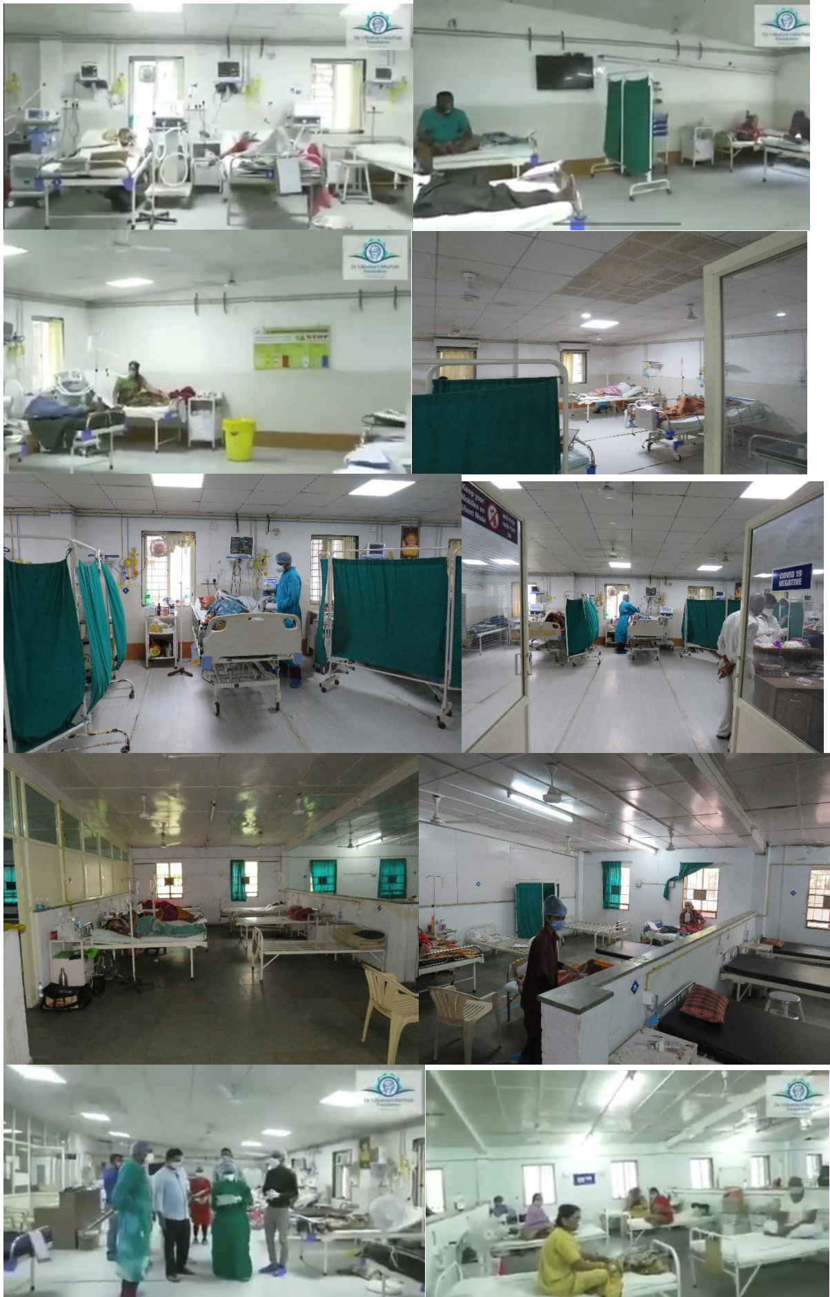
Photo gallery -